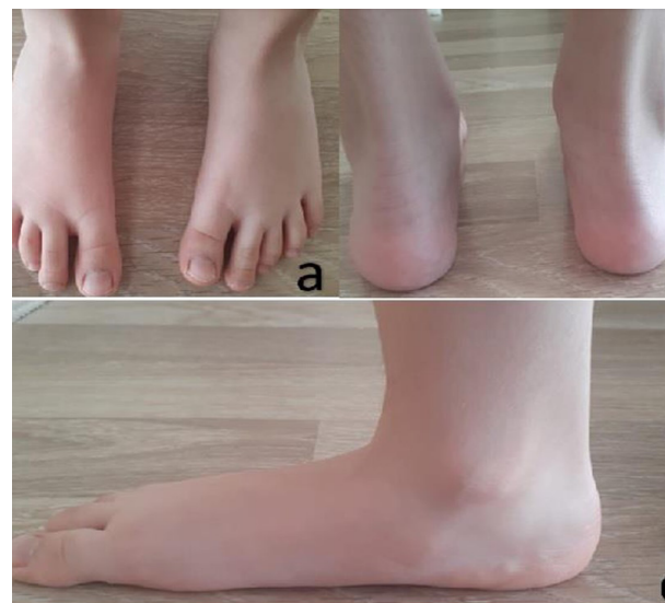
Figure 1: Anterior (a), posterior (b) and medial (c) images of a flat-foot.

2. Jack's test: While the patient is standing, he or she puts weight on the foot with the foot flat on the ground, and the clinician dorsiflexes the hallux, monitoring the increased concavity of the arches of the foot. A positive result (arch formation) results from the flatfoot being flexible. A negative result (lack of arch formation) results from the flatfoot being rigid.