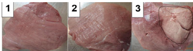
Figure 1: Visual destructured meat classes (1 = Normal, 2 = Potential, 3 = Destructured) defined in topside muscle from the ham.