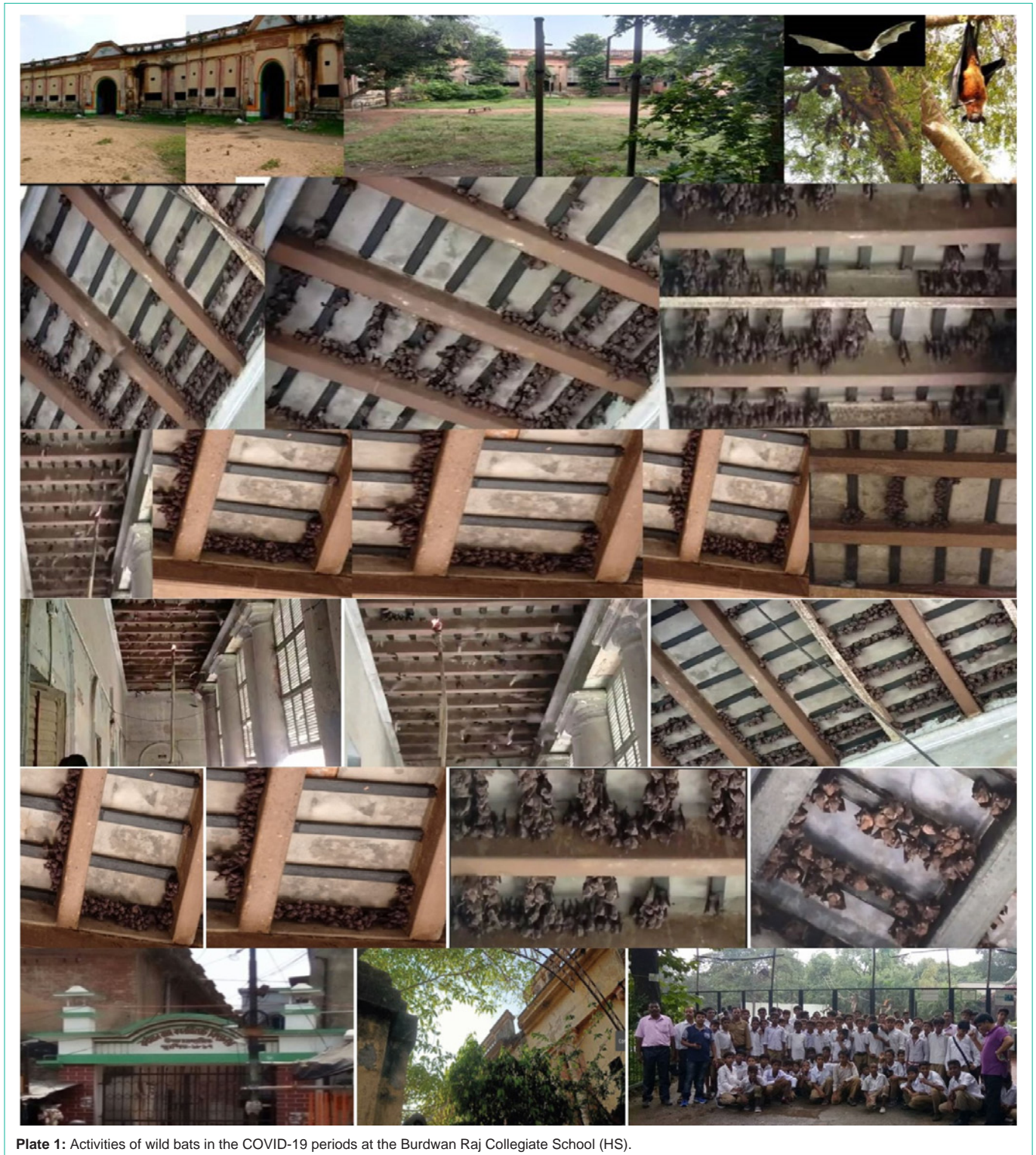
Plate 1: Activities of wild bats in the COVID-19 periods at the Burdwan Raj Collegiate School (HS).

thrice or more. All the data were counted for statistical analysis by the Analysis of Variance (ANOVA) [10,11,36-39].