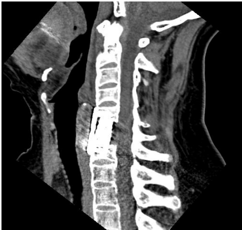
Figure 2: Internal instrument fixation over C5-7 with titanium mesh cage fusion.

identification of stable fractures is substantial in avoiding adverse neurologic outcome result from spine fracture [5]. Computed tomography (CT) may be the first choice with a shorter scanning time, and it can show bony details, including fractures and fragments. MR imaging can be much helpful in some patients with diagnostic limitation. 6 Prompt imaging studies of CT or MRI should be arranged to establish the diagnosis if needed.