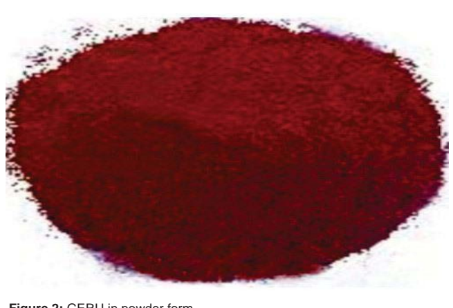
Figure 2: GERU in powder form.

deficiency) is an X-linked recessive genetic condition that predisposes to hemolysis (spontaneous destruction of red blood cells) and resultant jaundice in response to a number of triggers, such as certain foods (fava beans containing divicine [14]), illness, drugs (antimalarials) or some heavy metals [2].