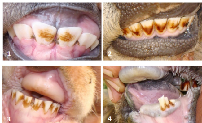
Figures 1-4: Moderate and severe form of dental fluorosis in bovine calves (Figure 1) and adult (Figure 2) and adult sheep (Figure 3) and old goat (Figure 4) animals.

In fluorosed animals intermittent lameness, swollen joints, debility, morbidity, wasting of body muscles and bony lesions in the mandibles, ribs, metacarpus, and metatarsus regions are the resultant of severe form of chronic fluoride poisoning (as in Figures 5-8). Fluoride-induced these pathological bony changes are collective known as skeletal fluorosis, which is more dangerous and highly painful in early of age of animals. In this condition, the animal is neither able to walk properly nor can get up and sit. Such animals also cannot move their neck properly up-down and right-left. Generally, fluoride-induced deformities in the teeth and bones remain for the whole life of animals and they are not cured by any medicines. In fact, once these deformities develop, they never reverse [44].