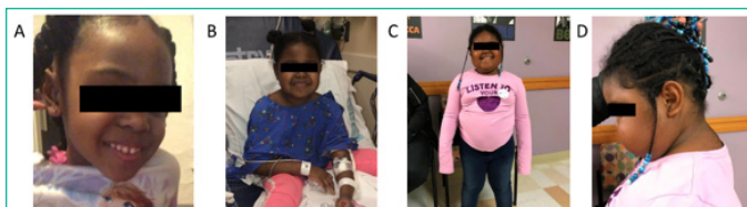
Figure 1: Photographs of patient taken over time. Photograph A was taken three weeks prior to initial presentation, B at initial presentation, C and D three months after initial presentation.

Transsphenoidal surgical resection of ACTH secreting pituitary adenomas is first line treatment of Cushing disease and