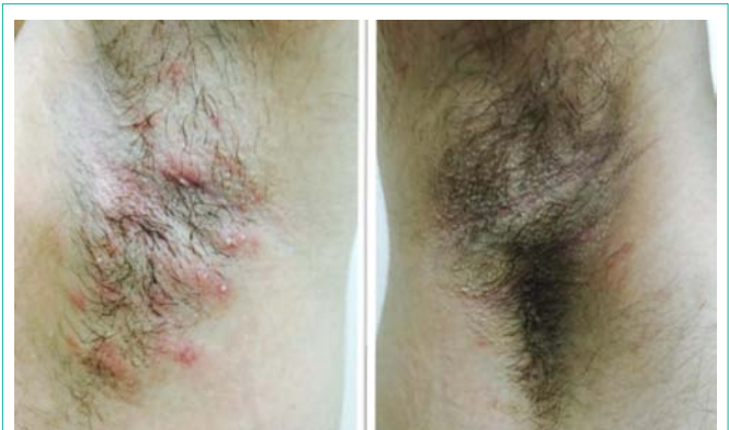
Figure 1: (a-left) Skin lesion in the left axilla. (b-right) Skin lesion in the right axilla.

After being prescribed a non-steroidal anti-inflammatory drug