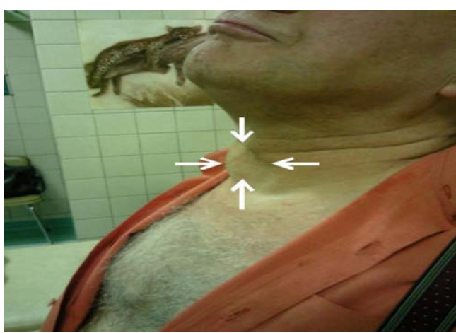
Figure 1: Case 1, input clinical findings.