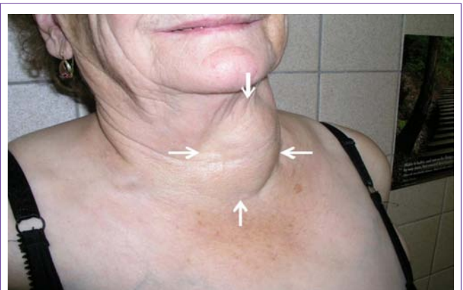
Figure 3: Case 2, input clinical findings.

The largest and most successful studies were those with patients treated for recurrent thyroid cysts. The reported studies mostly comprised tens or even hundreds of patients, such as those by Del Prate et al. (98 patients), Kim YJ et al. (127 patients) or Lee and Ahn (432 patients) [10,12,13]. The approach was found to be highly effective. In the vast majority of cases, the cysts volume was reduced (to less than 50% of the initial volume) or the fluid component even disappeared completely, both of which are considered a therapeutic success [7]. The outcome is affected by the initial cyst volume and character of the fluid component [14]. The method was compared