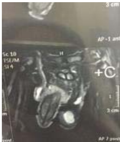
Figure 1: Scrotal MRI: Lobulated exophytic soft tissue masses replacing most of testes parenchyma with thin mantle of testicular tissue extending to epididymis & spermatic cord with hydrocele and varicocele.