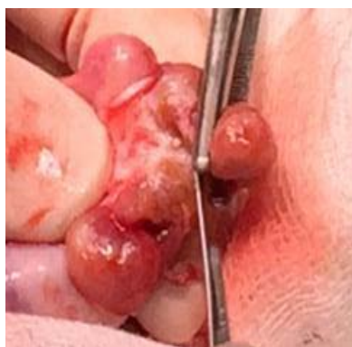
Figure 2: Gross examination of the orchietomy specimen: multiple lobulated testicular lesions (brown in cut section).