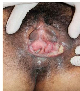
Figure 1: Ulcer 4 x 5 cm, irregular and erythematous borders.

The reported adverse events during HU treatment are numerous and concerning different body systems, including bone marrow,