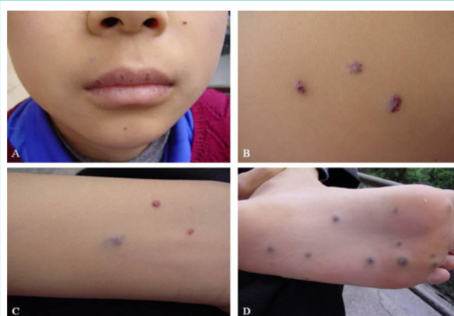
Figure 1: Multiple bluish-black lesions on the face (A), trunk (B), arm (C) and foot (D).

oral ferrous sulfate and vitamin B12. Three weeks later, his symptom with dizzy, lassitude, inertia improved gradually. Hemoglobin level and RBC count returned to 75.2g/L and 3.58 \times 10^{12}/L , respectively. Treatment continued after he left hospital. Half one year later, the symptoms with dizzy, lassitude, inertia improved completely, and hemoglobin level and RBC count return to normal limits. Signs of bleeding complications were not found by endoscopic examination. Long term follow-up is in progress.