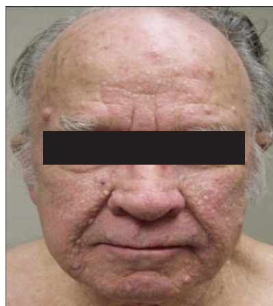
Figure 1: Skin-colored papules of NF1 on the temples and jaw line and those of BHDS on the cheeks, nose, and chin.

The lung findings in conjunction with biopsy-confirmed fibrofolliculoma supported a diagnosis of BHDS. Genetic testing showed positive heterozygous duplication of 28 nucleotides of the FLCN gene in exon 9, leading to a premature stop codon and predicted loss of normal function. This duplication has been previously published by Nickerson, et al. in another family with BHDS (family 228 in the reference) [5]. Surveillance renal ultrasound