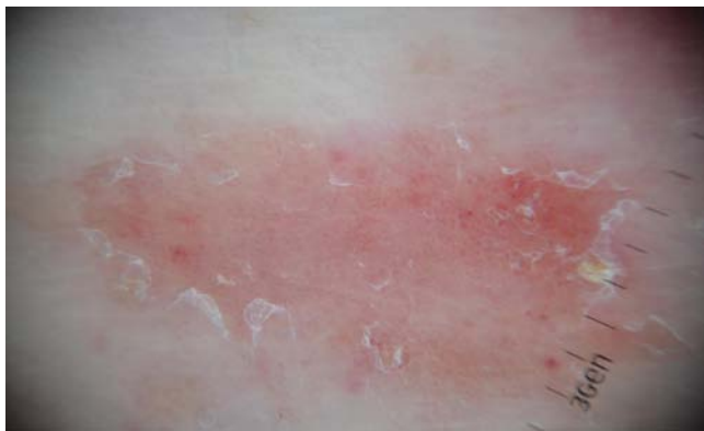
Figure 1: Dermatoscopy of a psoriatic plaque: homogeneously distributed dotted vessels over a light red background associated with diffuse white scales (X10).

“red dots” (Figure 1). These dots represent the view from the top of the tortuous, ecstatic and elongated capillaries within the elongated dermal papillae [10].