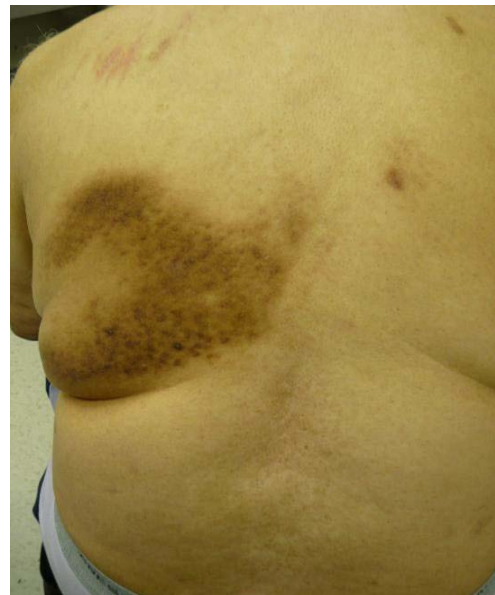
Figure 5: Lesion from patch testing site.

mg folic acid for his biopsy proven psoriasiform dermatitis was -0.82 while the correlation coefficient when the patient was on continuing on 6 mg along with topical and intralesional therapies for LSC was less negative at -0.52. Correlating BSA of just the psoriasiform dermatitis biopsied areas with this patient begun on either 5 or 6 mg. folic acid was not impressive (correlation coefficient was -0.41).