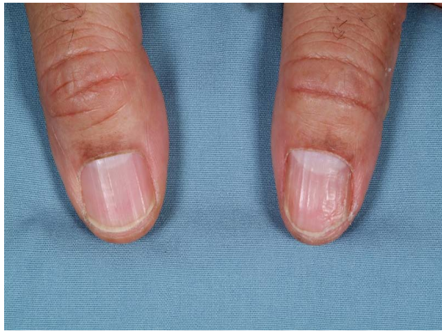
Figure 6: Thumbnails, showing pitting.