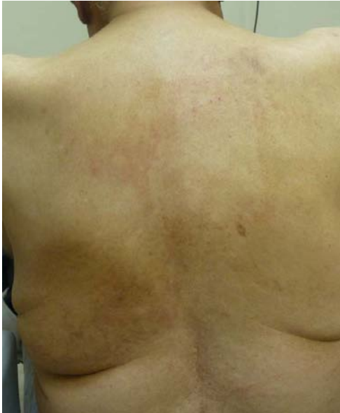
Figure 3: Back cleared on vitamins.

right calf lesion had vanished. His folic acid dose was increased to 6 mg daily. Three weeks later (5/7/2010) the back showed at best some mild flattening (Figure 3), his buttock lesion had not changed (Figure 4) and his calf lesion had reappeared covering 0.35% BSA with total BSA 2.6%. Intralesional triamcinolone and clobetasol spray were then resumed except to the back plaque. After 2 more months of this therapy (6/25/2010) his back was clear and remained clear as of 3-7-2014 except for some focal erythema in the back location (Figure 5). As of 6/25/2010 his right calf involvement was 0.35% and total BSA 1.2%. By 11/12/2010 his calf cleared only to reappear 1/13/2011. This area was rebiopsied on 4/15/2011 but his time histopathology was not psoriasiform dermatitis but rather Lichen Simplex Chronicus (LSC) as were biopsied lesions on his left calf and buttock. Importantly his nail pitting disappeared with folic acid therapy (Figure 6). Charting comparing folic acid dose with percent BSA covered by biopsy proven psoriasiform dermatitis and LSC showed a possible relationship with folic acid dose and improvement of the former but not the latter (Figure 7). Correlation Coefficient when starting or continuing on 6