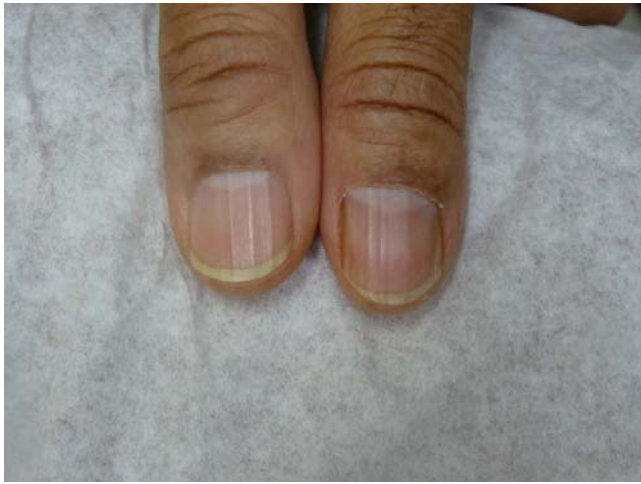
Figure 2: Thumbnails showing no pitting.