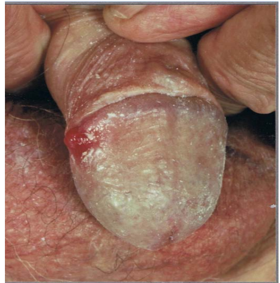
Figure 2: 6mm x 7mm fleshy, red papule on glans penis.