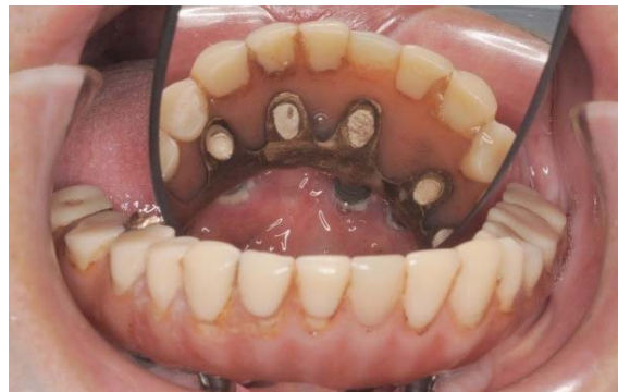
Figure 4: Fixed implant rehabilitation after 14 years.