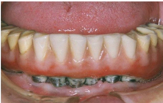
Figure 1: Poor oral hygiene of a fixed implant prosthesis by aging.