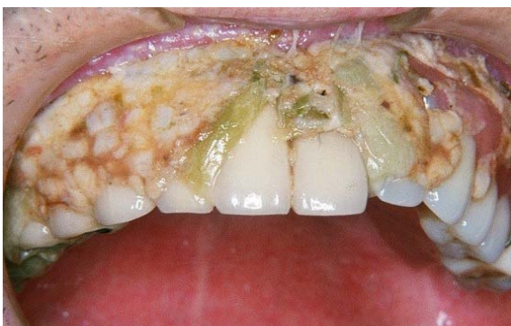
Figure 2: Serious oral hygiene after dementia.