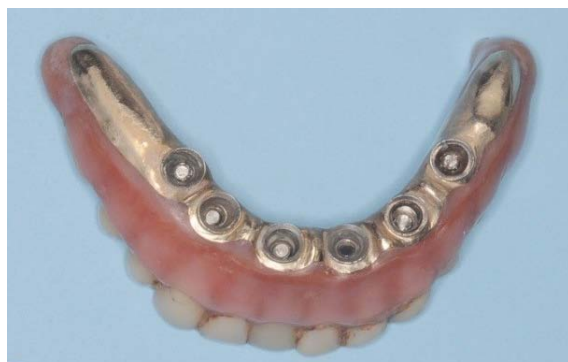
Figure 5: Poor care of basal surface.