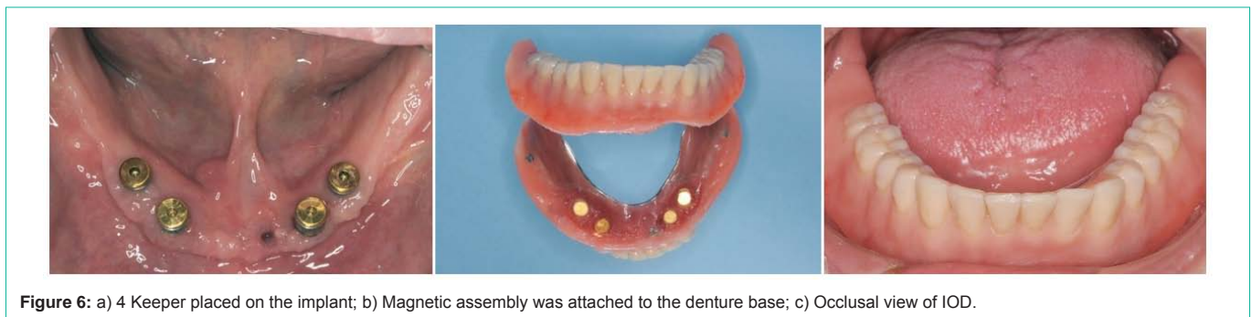
Figure 6: a) 4 Keeper placed on the implant; b) Magnetic assembly was attached to the denture base; c) Occlusal view of IOD.

Regarding cognition and comprehension, when a patient develops dementia, it becomes difficult to get used to new dentures. Therefore, the oral design should be changed to implant overdentures before the patient develops dementia.