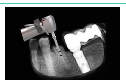
Figure 3: Hole is drilled into root.