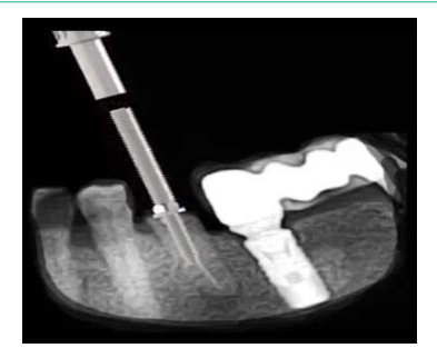
Figure 4: Extraction screw is connected to screw driver.

extraction screw position can be set according to the distal and mesial directions of the adjacent teeth and the position of the tooth to be extracted (Figure 4).