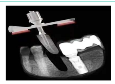
Figure 6: Extraction of root.