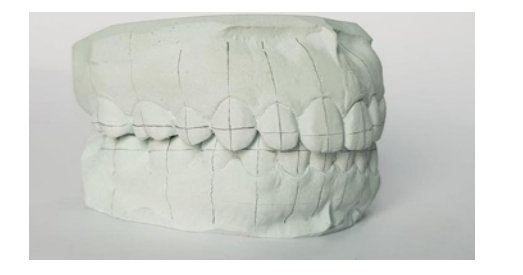
Figure 4: Cast in occlusion to ensure enough space for bracket placement.