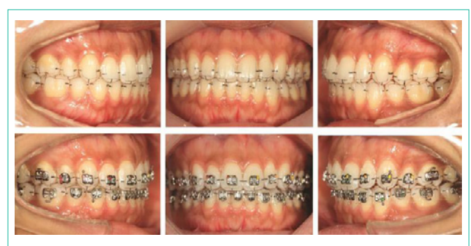
Figure 18: Bracket placement with the guiding template.

made guiding template for direct bracket placement. The main purpose of this technique is to facilitate the transfer to the patient's teeth of the laboratory-planned bracket positioning guidelines. With the guiding template, the use of additional positioning-brackets to orient the practitioner during the bracket placement is eliminated, consequently simplifying and reducing chairtime.