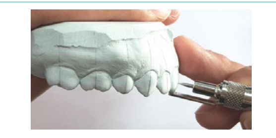
Figure 2: Working cast with long axes and bracket slot heights marked in pencil.

program with students in the beginning of their clinical training.