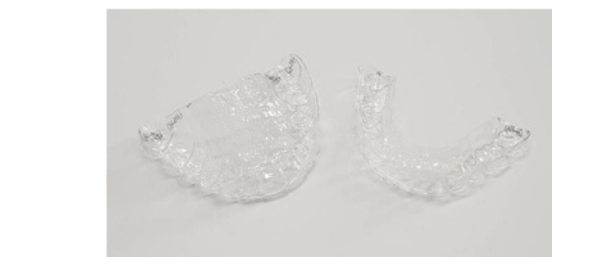
Figure 5: Highly transparent thermoplastic trays.