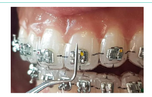
Figure 14: Fine bracket adjustment aided with the guiding template.