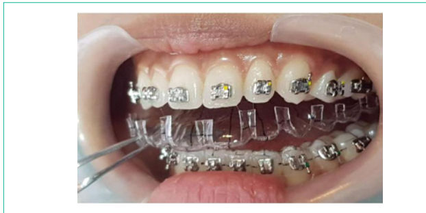
Figure 17: Guiding template removal.