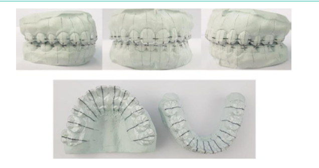
Figure 9: Guiding template with slots on the working cast.

obtained. All defects and imperfections are removed.