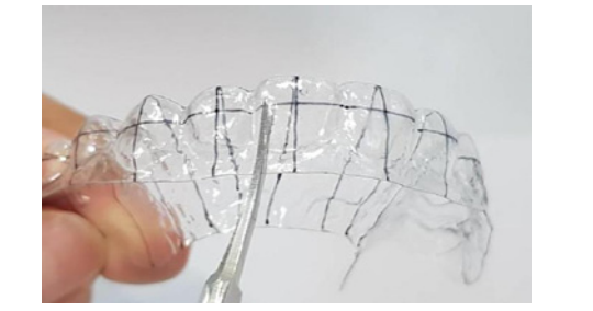
Figure 8: Creation of small slots for easy bracket placement.