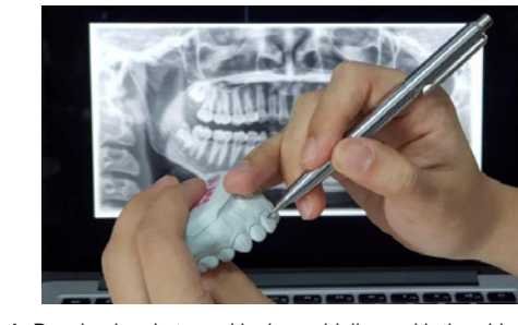
Figure 1: Drawing brackets positioning guidelines with the aid of panoramic radiograph.

In order to achieve a more precise bracket positioning, several indirect bonding techniques have been proposed [10-13]. The main advantage of indirect bonding techniques over direct bonding techniques is to allow a precise and controlled preparation of bracket positioning in a laboratory setting. Individualized transfer trays are fabricated from a wide range of materials, such as vacuum-formed thermoplastics and silicone impression materials, and optimize bracket placement in the clinical setting, therefore reducing significantly chairtime [2-8]. The process is laborious and requires an experienced laboratory technician or a computer operator to allow the correct bracket positioning [6-8]. Moreover, indirect bonding technique still cannot be considered a gold standard for correct bracket placement because of numerous variable factors that might compromise the final accurate placement [10]. Any distortion or misalignment of brackets in the transfer tray or incorrect tray fit or lack of stability in the patient's mouth might cause errors in the final bracket positioning [11,12]. However, indirect bonding is not the most desirable technique to be used in an academic orthodontic