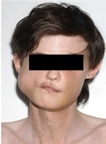
Figure 1: Showing the extensive haematomas experienced by our patient.