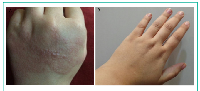
Figure 1: (A) Eczematous reaction on the dorsum of the left hand (Case 1), (B): Recovery follow-up of the dorsum of the left hand after 2 months (Case 1).

A 31-year-old male dental intern, who has used latex powder gloves during mid April 2015 to perform an operative dental procedure, developed redness and burning of his right fingers. The thumb was affected the most. After two days, the thumb's skin sloughed with moderate pain and bleeding lasting five days (Figure 2A, B). He had no rash elsewhere. Topical corticosteroid creams and Vaseline cream were used to relieve the pain and initiate healing. After two weeks, his thumb was affected again yet healing only took