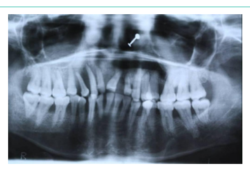
Figure 2: Orthopantomogram (OPG).