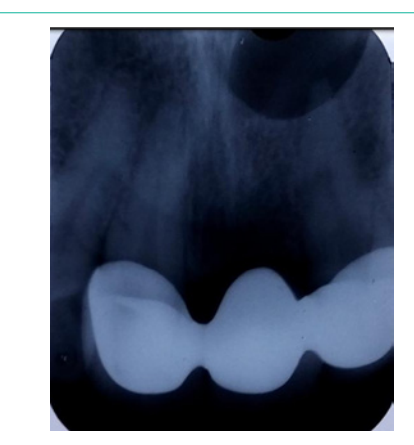
Figure 2: IOPA showing well defined peri apical to 22.