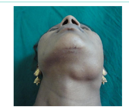
Figure 1: Diffuse swelling in the left submandibular region.

A 22 year old female patient presented with a swelling in the left submandibular region (Figure 1 and 2). The swelling had been growing insidiously for one year and was associated with pain since two weeks which was mild, continuous and radiating. Extraoral examination revealed a diffuse enlargement with imprecise borders measuring around 4x5cms in size in the left submandibular region with normal overlying skin. On palpation the submandibular lymph node was enlarged, firm in consistency, tender and mobile. No abnormalities were detected intraorally. Provisional diagnosis of submandibular lymphadenopathy was given. Tuberculous lymphadenitis was considered in the differential diagnosis. On investigations, Ultrasonography revealed multiple enlarged lymph nodes with areas of necrosis involving the submandibular region. FNAC revealed granulomatous lymphadenitis. Excision of the lymph nodes was done under general anesthesia and histopathological examination of the specimen confirmed the diagnosis of tuberculous lymphadenitis. Patient was referred to a physician who prescribed a WHO endorsed anti-tubercular therapy for 6 months. Periodic follow up showed complete resolution of the lesion.