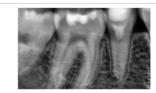
Figure 1C: Periapical radiograph. Radiographic image taken at the 24-month follow-up appointment.