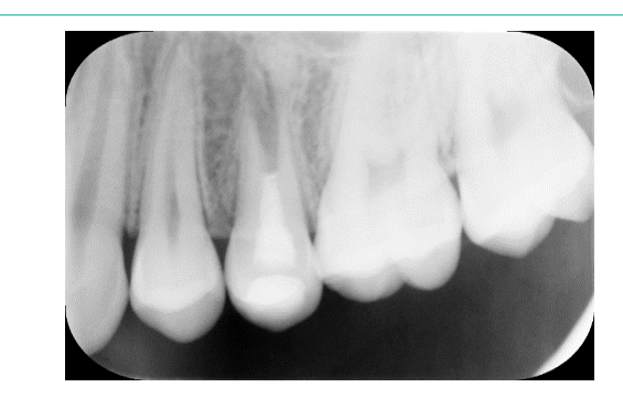
Figure 2C: Periapical radiograph. Radiographic image taken at the 18-month follow-up appointment.