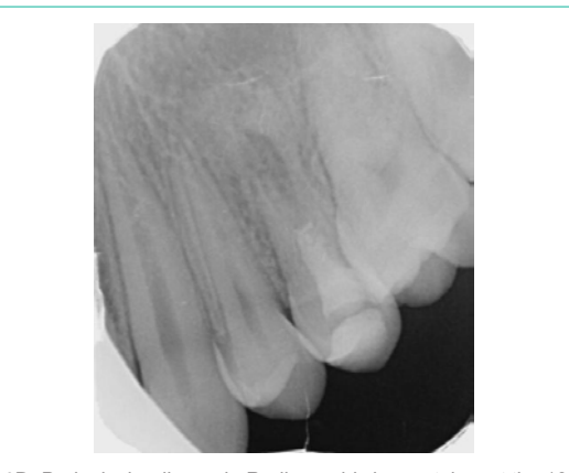
Figure 2B: Periapical radiograph. Radiographic image taken at the 12-month follow-up appointment.