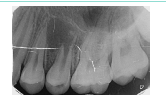
Figure 2A: Periapical radiograph. It Ilustrates incomplete root formation (1/2 root formation) and a diffuse periapical radiolucency extending to the apex of tooth 24#.

The patient and his parents were informed of regenerative endodontic treatment and consent was obtained from them. After local anesthesia with 3% plain mepivacaine, the tooth was isolated with rubber dam. An access cavity on tooth UL5 was prepared by