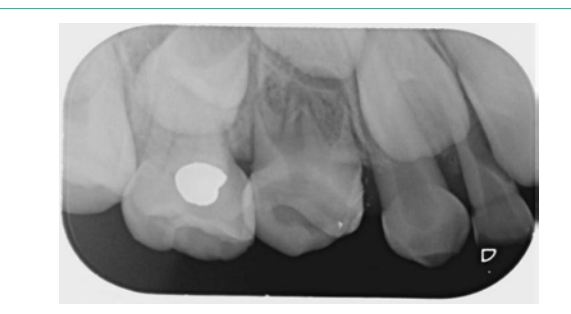
Figure 3A: Periapical radiograph. It Ilustrates almost no root formation and a radiolucent periapical lesion adjacent to the tooth #14.

In endodontics, treatment of necrotic immature teeth is very challenging because of the root anatomic structure, difficulty of the apical seal, and susceptibility to fracture. To eliminate these complexities and obtain a better prognosis, regenerative endodontic treatment or pulp revascularization is improved as an alternative method for the treatment of necrotic immature teeth. The regenerative endodontic treatment technique was first applied by Nygaard-Ostby and Hjortdal in 1971 and many case-based studies have been done about this approach until recently [6,17]. Basically, regenerative endodontic treatment is described as the stem-cell therapy that includes pulp revascularization, apexification, apexogenesis, and tissue engineering [18]. It has been proposed that stem cells from the apical papilla could be introduced into the canal because of the disorganization of the apical papilla tissue with an