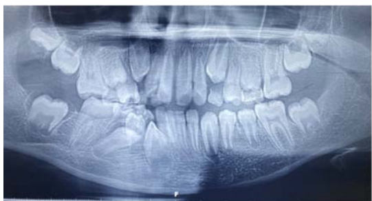
Figure III: Radiographic picture showing mixed dentition.