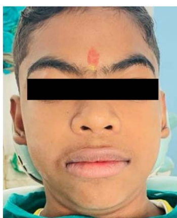
Figure II: Picture of extraoral feature showing hypertrichosis, thick lips and bulbous nose.