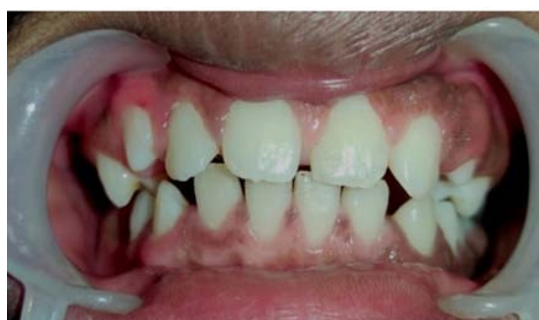
Figure VI: Post operative picture after surgical excision after 3 months.

maintenance therapy as shown in (Figure VI).