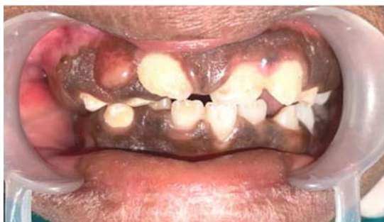
Figure I: Pre operative intraoral picture showing enlargement.