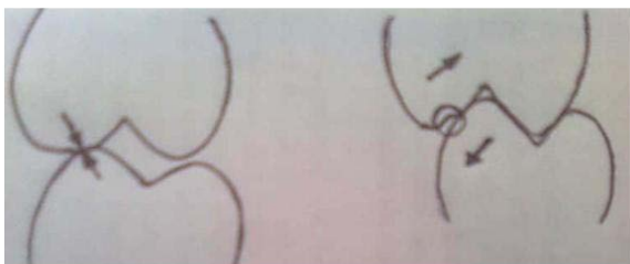
Figure 4: Degradation due to abrasive process.