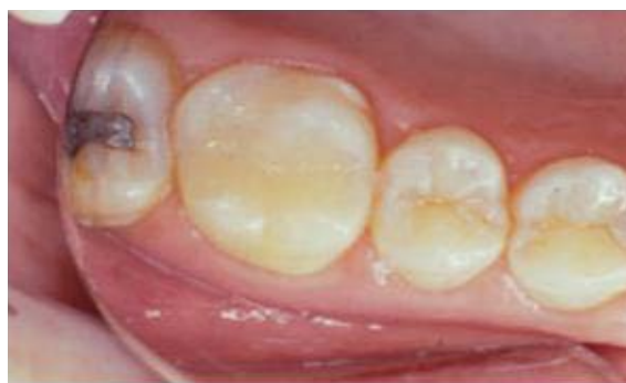
Figure 1: Composite restoration.

Degradation of the matrix is influenced by the curing degree or irradiation. The increase of curing degree will affect the degradation of the filler surface by increasing the thickness of the resin and reduce the degree of diffusion through the matrix material so that the reaction on the surface of the filler material will be slow. Matrix degradation can also be caused by the heat generated during the polishing procedure. Heat to 200° C will cause depolymerization of methyl methacrylate-based resin to form monomers. This will result in the formation of porous and decrease of composite density. Enzymes like esterase in the oral cavity can also damage the resin bond. Research conducted