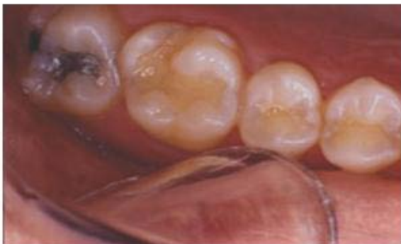
Figure 2: Degraded composite restoration.