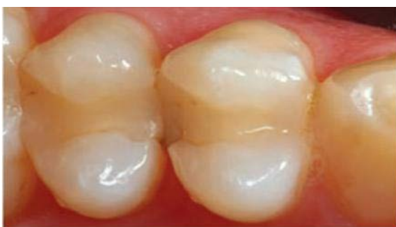
Figure 5: Clinical view of degraded composite restoration due to abrasive process.

Inhibitors of matrix metalloproteinases: In the hybrid layer degradation by MMP's, MMP's inhibitors act to protect the collagen in the hybrid layer. According to Gendron et al, chlorhexidine could inhibit MMP-2, -8, -9, and even at very low concentrations while maintaining the integrity of the hybrid layer. However, chlorhexidine has only limited substantivity. The role of chlorhexidine is to delay dentin demineralization rather than to stop bonding degradation permanently. It also should be noticed that there is the zone of resin-less demineralized dentin. Chlorhexidine only works on etch and rinse adhesive, since chlorhexidine can not bind to the collagen matrix in an acidic environment [10-15].