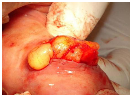
Figure 2: Surgical resection of oral lipoma.

hematoxylin and eosin, revealing mature fat cells arranged into lobules separated by septa of fibrous connective tissue. It was diagnosed as oral lipoma. No recurrence of the pathology was observed during a 2-year observation period.