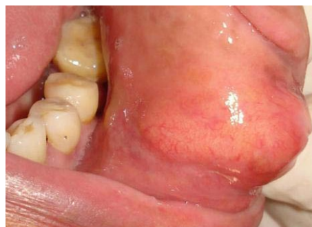
Figure 1: Intra-oral view of the lesion.

The lesion was presumptively diagnosed as oral lipoma, and differentially diagnosed as pleomorphic adenoma, mucoepidermoid carcinoma, fibroma, dermoid cyst, minor salivary gland tumors, mucocele, hemangioma, lymphangioma, rhabdomyoma or neuroma. Surgery was performed under local anesthesia, and the lesion was totally enucleated, with meticulous dissection of circumscriptive tissues (Figure 2). The wound was closed with 3.0 silk sutures (Figure 3). The resected tissue was fixed in formalin for histopathological examination (Figure 4). The postoperative period was uneventful (Figure 5). During the histological study, the tissue was stained with