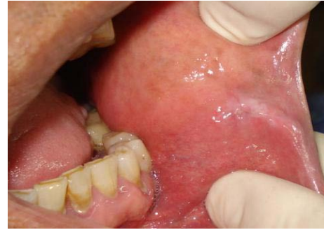
Figure 5: Follow-up of the surgical site on day 10.