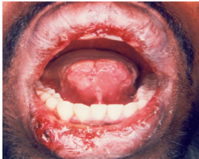
Figure 6: Multiple large shallow irregular ulcers which bleed profusely with bloody crustations in lips in erythema multiforme.