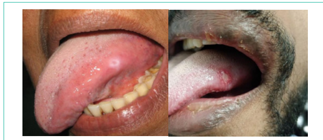
Figure 10: a & b – A chronic traumatic ulcer in left lateral border of tongue due to sharp edges of molars.

A detailed history and examination can distinguish RAS from acute viral ulcers or chronic autoimmune lesions, drug reactions and