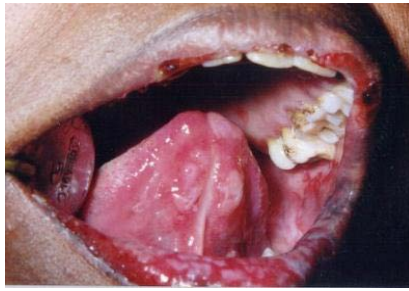
Figure 12: Pemphigus ulcers showing extensive ulcerations and bloody crustations in lips.

Four forms of stomatitis that have been recognized are ulcerative form, hemorrhagic form, nonulcerative pseudomembranous form and hyperkeratotic form. The latter two are commonly appear as white lesions. The hyperkeratotic form presents as multiple, painful white keratotic lesions with thin projections whereas the nonulcerative form may exhibit a erythematous pultaceous form characterized by red mucosa covered with a thick exudates and a pseudomembrane. The tongue and the floor of the mouth are more frequently affected. Xerostomia, unriniferous breath, dysgeusia and burning sensation are common symptoms [25].