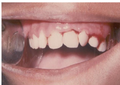
Figure 7: The characteristic blunting and punched out ulcer of interdental papilla in ANUG.

These ulcers heal by 10 to 14 days [14].