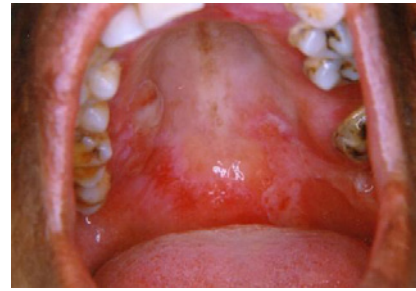
Figure 13: Bullous pemphigoid showing ruptures bullous lesion appearing as large irregular ulcers in the palate.

Some studies have shown prevalence of ulcers, both traumatic and aphthous mostly in patients with type 2 diabetes. Oral mucosal alterations in diabetes may cause symptoms such as glossodynia,