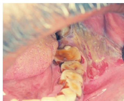
Figure 2: Chemical burn produced by the placement of tablet aspirin.

formocresol, sodium hypochlorite, monomer and the like. Among the dental materials, liquids are likely to cause chemical oral burns because they can be difficult to manipulate. Chemical burns due to aspirin are seen in patients who keep the aspirin tablet to relieve pain (Figure 2) [5]. Mucosal alterations can also be caused by mouth washes or oral care products with high alcohol content.