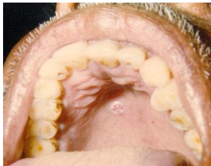
Figure 3: Chronic nodular lesion with surface ulceration of Necrotizing sialometaplasia.