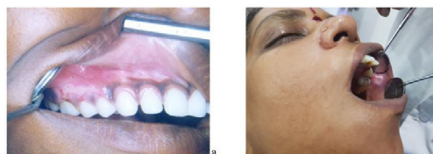
Figure 1: a) Traumatic ulcer in the gingiva in brush injury, b) Traumatic ulcer due to sharp tooth.

Oral mucosal damage can result from unintentional use of therapeutic agents during dental procedures such as eugenol,