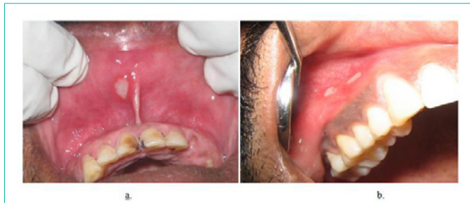
Figure 8: a) single round ulcer in upper labial mucosa with yellowish white slough in the floor with erythematous halo. b) Two ovoid ulcers of 3 mm size in the upper alveolar mucosa with yellowish slough in the floor and erythematous halo.