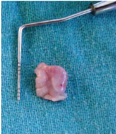
Figure 2: Excised gingival overgrowth.

lesions however, have been confused in the past to clinically similar enlargements seen in non-pregnant females as well as males [6]. These lesions have been coined by the term pyogenic granulomas.