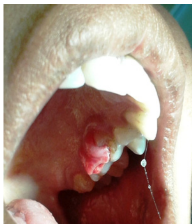
Figure 1: Preoperative view.

These lesions show a predilection for the interdental papillae region, maxillary anterior region being affected the most [5]. These