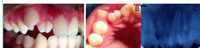
Figure 2: Views. A) Buccal, B) Palatal and C) Radiographic.