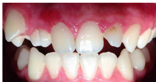
Figure 1: Initial condition of the patient.

The anamnesis does not refer significant medical or family history of dental anomalies. In the clinical evaluation the patient has permanent dentition and the normal number of teeth, gingivitis and bad position presented in the previous sector, which is more pronounced on the right side; and it notes that the right lateral incisor