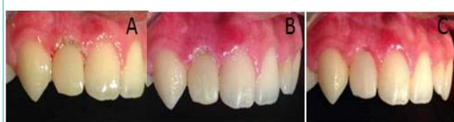
Figure 5: Postoperative: A) Immediate, B) One week, and C) Six months post-operative.

has a double tooth's appearance. Thermal pulp testing, percussion and periodontal probing showed no abnormalities.