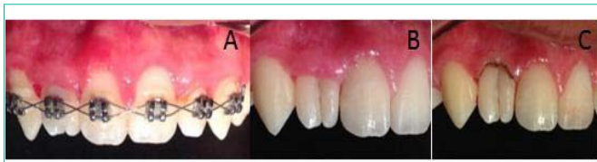
Figure 4: A, B) Final phase of orthodontics, and C) Gingivoplasty.