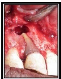
Figure 10: Showing removed infected, necrosed bone with a continuous apico-marginal defect being seen along with buccal wall with dehiscence and 3mm of root resected for apicoectomy with 3mm gutta percha removed from the apex with the help of a heated probe.