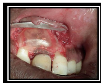
Figure 15: Showing collagen membrane placed over the defect.