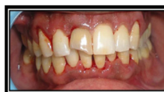
Figure 6: Showing oral prophylaxis done in relation to maxillary arch.