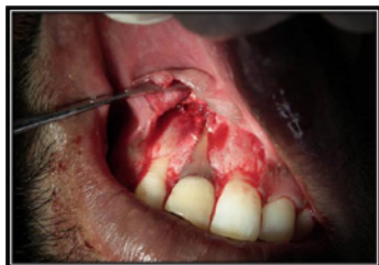
Figure 9: Showing crevicular incision given in relation to 12, 11, 21 region with raised full thickness mucoperiosteal flap.