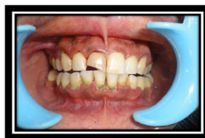
Figure 1: Showing discolored, non-vital 11 with Ellis class IV fracture.

harvest without any artificial biochemical modification [9]. The PRF clot forms a strong natural fibrin matrix, which concentrates almost all the platelets and growth factors of the blood harvest and shows a complex architecture as a healing matrix, including mechanical properties no other platelet concentrate offers [10-11]. It is an autologous biomaterial which has found numerous clinical applications which have been described in the specializations of