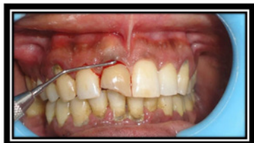
Figure 3: Showing probing depth of around 15mm as measured with the help of a periodontal probe.

oral maxillofacial surgery [12-14] and in dental implantology [15-16]. Given the unique properties of autologous PRF and already demonstrated regenerative capacity of commercially available bone grafts, application of a combination approach was attempted. We present here a case report with a 12 month follow-up report of a combined endo-perio lesion, which was treated by means of combination of autologous PRF with bovine derived xenograft, and assessed clinically and radiographically.