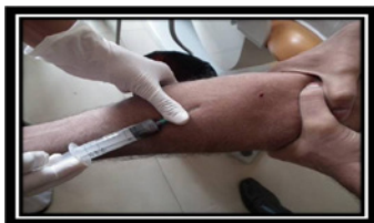
Figure 11: Showing blood sample of the patient being drawn in 10mL test tubes without an anti-coagulant for centrifugation.

completion of the endodontic treatment. Routine blood investigations were advised for which the reports were found to be normal. Pre-surgical periodontal pocket depth was reduced to 7mm (Figure 8). After proper isolation of the surgical field, the operative site was anaesthetized using 2% xylocaine hydrochloride with adrenaline (1:200000). A crevicular incision was given covering 12, 11, 21 region and a full thickness mucoperiosteal flap was raised (Figure 9). The infected, necrosed bone was removed and a continuous apico-marginal defect was observed along with buccal wall with dehiscence. 3mm of root was resected for apicoectomy and 3mm gutta percha was removed from the apex with the help of a heated probe (Figure 10).