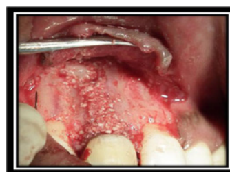
Figure 14: Showing Demineralised Bone Matrix (DBM) xenograft placed over the peri-apical defect and the entire root length devoid of bone.