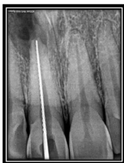
Figure 4: Showing working length determination as seen on IOPAR.

At the initial visit, immediate emergency access opening was done and the pus was drained-out. The access was kept open and only a thick cotton pledget was used to close the access for a day. Next day, the patient was recalled and the cotton pledget was removed and the canal was re-irrigated with saline. The swelling had reduced.