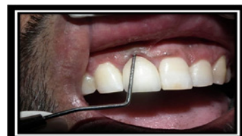
Figure 23: Showing pocket depth reduced from 15mm to 3mm.

18). Antibiotics and analgesics were prescribed for one week. After 15 days, the pack was removed. The sutures were removed and the healing was found to be uneventful. The crown preparation with 11 was done (Figure 19) and elastomeric impression was recorded (Figure 20). All Ceramic Emax crown was fabricated and cemented (Figure 21). The patient was asked for regular follow-up visits and the 12 months post-operative radiograph was taken which revealed apparent bone fill with resolution of the osseous defect (Figure 22). Clinical evaluation of the periodontal pocket depth revealed a successful outcome of the procedure with a considerable reduction in pocket depth that got reduced from 15mm to 3mm depth (Figure 23).