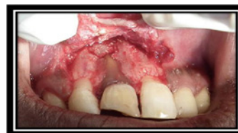
Figure 13: Showing PRF clot placed inside the peri-apical defect.