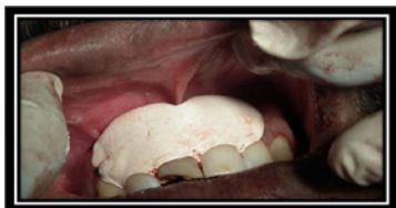
Figure 17: Showing perio pack over the sutured area to make the repositioned flap immobile till it heals.