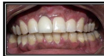
Figure 21: Showing all Ceramic Emax crown cemented in relation to 11.