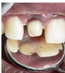
Figure 19: Showing crown preparation in relation to 11.