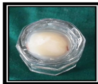
Figure 12: Showing PRF clot in the dappen dish.