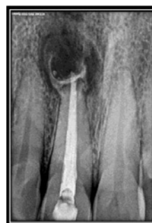
Figure 7: Showing completed endodontic treatment in relation to 11.