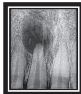
Figure 2: Showing IOPAR revealing a large peri-apical radiolucency.