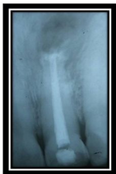
Figure 18: Showing immediate post-operative radiograph.