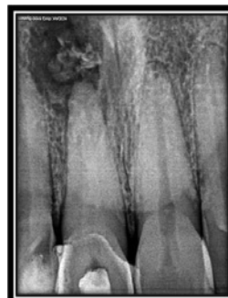
Figure 5: Showing calcium hydroxide dressing with access opening closed with a temporary restoration as seen on IOPAR.