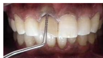
Figure 8: Showing pre-surgical photographs with periodontal pocket depth reduced to 7mm.

Patient was recalled for irrigation and dressing after 4 days till which time, the swelling had completely resolved. Working length and biomechanical preparation were completed with the tooth (Figure 4). Calcium hydroxide dressing was given for 7 days and the access was closed with a temporary restoration (Figure 5). A dressing was given again and the patient was recalled after 7 days for the follow-up and then, the patient was transferred to Department of Periodontics for opinion and needful. A thorough oral prophylaxis was done in the concerned region (Figure 6) and the patient was recalled for completion of endodontic treatment (Figure 7).