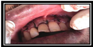
Figure 16: Showing sutured flap with 3-0 black braided silk.