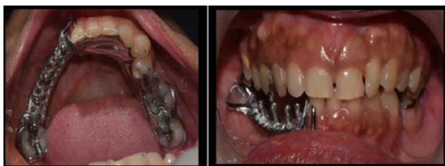
Figure 4: Framework fit verified.