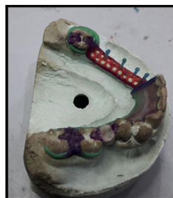
Figure 2: Wax pattern fabricated.

discussed with the patient. An implant-retained prosthesis was suggested to the patient because of the increased retention, stability and support. However due to financial constraints, the patient opted to carry out the rehabilitation with a cost effective, conventional method. The conventional cast partial denture (CPD) needed to be modified to account for the absence of the labial vestibule