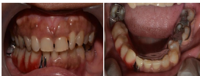
Figure 5: Try in.