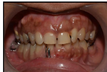
Figure 6: Final CPD insertion.

Mouth preparations were done for various cast partial components and an impression was made of the mandibular arch with addition silicone (Aquasil, Dentsply) using the two step putty wash technique. The master cast was poured in type IV die stone (Kalabhai) and surveyed to ascertain and check parallelism of guide planes, survey lines and useful undercuts in final designing of the framework. Block out procedure was done and the cast was duplicated in reversible