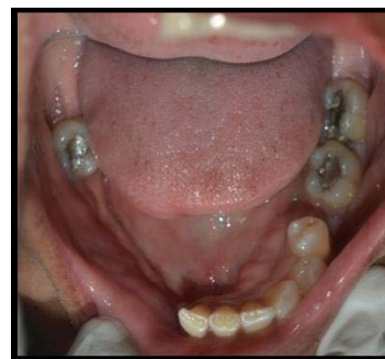
Figure 1: Mandibular dental arch.

After extra and intra-oral examination, the treatment plan was