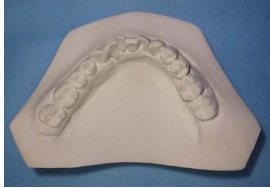
Figure 5: Mandibular study model of a patient with asymmetric and excessive intra-arch width in premolar and molar region.

also beneficial in patients exhibiting asymmetric and excessive intra arch mandibular width in premolar and molar region (Figure 5). Moreover, patients with traumatic injuries of mandible with limited mouth opening can also benefit from such an impression technique.