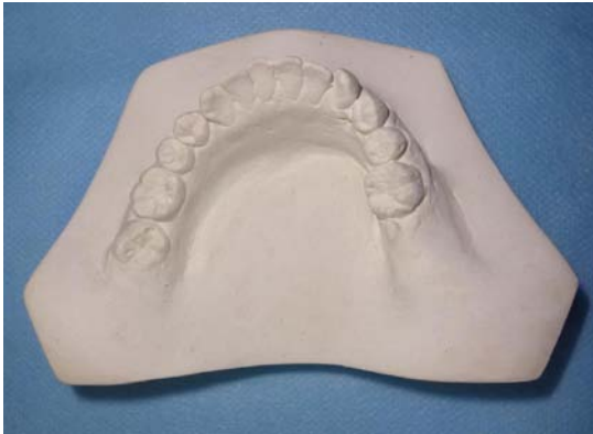
Figure 4: Retrieved study model of a patient with asymmetric mandibular arch form.