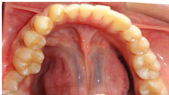
Figure 1: Intraoral occlusal view showing asymmetric mandibular arch form.

Patients with facial asymmetry often present with varying degrees of in the size and shape of upper and lower dental arches, and in the position of teeth on either side of the dental arch. A morphogenetic pattern of these patients tends to result in abnormal maxillary and mandibular bony architectures [1]. In such patients with grossly asymmetric mandibular arches, obtaining good lower impressions with conventional lower stainless steel trays is often difficult (Figure 1) since the process requires precise adjustment of flanges of the