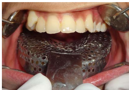
Figure 2: Intraoral view showing correct positioning of maxillary dentulous tray for taking impression of the mandibular arch.