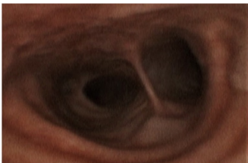
Figure 1c: After 30 days of nebulized and IV antifungal therapy.

days after initiation of inhaled therapy showed great improvement (Figure 1c). Weaning and mobilisation could be done successfully and decannulation was performed 55 days after hospital admission. The inflammation parameters decreased to normal values, the kidney parameters normalised. Inhaled lipAMB and intravenous ISA were stopped and oral VOR started (2x400mg once followed by 2x200mg for 8 weeks). The VORserum level was always within the range of 2-4 mcg/mL. BDG from serum decreased continuously (320 pg/ml after 38 days and 170 pg/ml after 45 days of antifungal therapy).