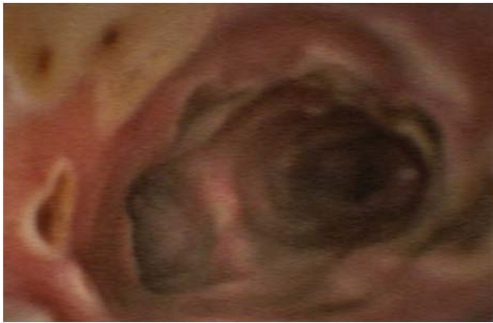
Figure 1b: After 10 days of IV antifungal therapy.