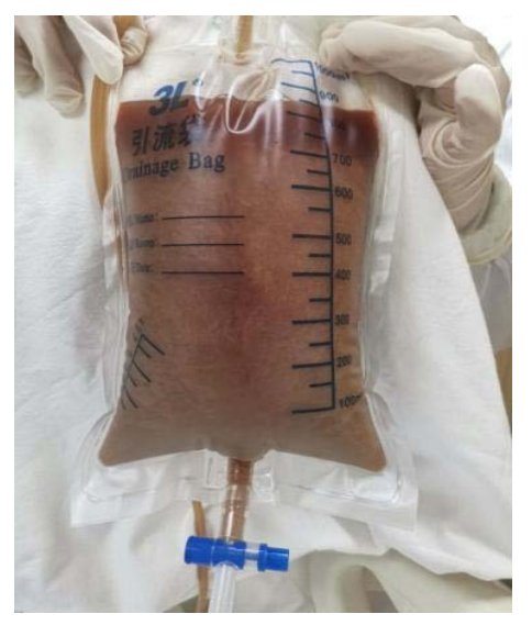
Figure 2: The ascites was anchovy-sauce-like fluid which indicated the possibility of amebic liver abscess.

To further clarify the diagnosis, on day 3 after admission, a liver Contrast Enhanced Ultrasonography (CEUS), which performed before and after the administration of Sulphur Hexafluoride Microbubbles (SonoVue) with grayscale scanning technique in real time, revealed a giant mixed echo mass (13.5*12.3 cm) in the right hepatic lobe. The mass boundary is not clear and irregular morphology. After SonoVue contrast administration, there is no enhancement in the peripheral and internal area of the mass (Figure 3, Video 1). Puncture and drainage were performed successively under the right phrenic (a total of 1790ml odorless anchovy-saucelike fluid) and crypt effusion of liver. Routine bacteriological culture and metagenomic Next-Generation Sequencing (mNGS) were inspected, all of which were also negative. On the fifth day after admission, the huge liver abscess was punctured under the guidance of bedside ultrasound, and the punctured fluid was also like "anchovy sauce" (a total of 2620ml). The abscess in the center and around the