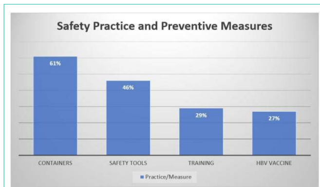
Figure 3: Safety practice and preventive measures among health workers in hospitals in Mukalla.