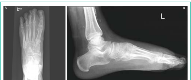
Figure 1: Left foot radiographs demonstrate (a) on the PA view, vascular calcifications between the first and second metatarsals, ankylosis of the second DIP joint, and bony remodeling of the second middle phalanx, compatible with a slow, benign adjacent soft tissue process. (b) Lateral view demonstrates marked soft tissue swelling at the dorsum of the foot and vascular calcifications of the distal leg.

Acroangiokeratosis describes a spectrum of skin manifestations of underlying vascular malformations. Stewart-Blue Farb syndrome describes skin lesions due to congenital AVM. Other variants of