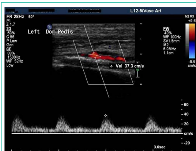
Figure 3: Duplex ultrasound of the left foot demonstrates loss of normal triphasic waveform and diminished amplitude of the dorsal is pedals artery waveform.

acroangiokeratosis include lesions due to chronic venous stasis (acroangiokeratosis of Mali), due to traumatic or iatrogenic arteriovenous fistula, in the setting of limb paralysis, and at amputation stumps in the setting of suction socket prosthesis use [2-4].