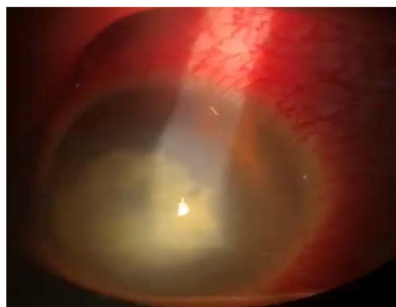
Figure 1: RE: Corneal opacity with stomal.

In this case, acute corneal hydrops was the initial presentation of KC in a pediatric patient with a suggestive history of allergic conjunctivitis, eye rubbing, and progressive loss of vision. Corneal hydrops was misdiagnosed as infectious keratitis, and KC was