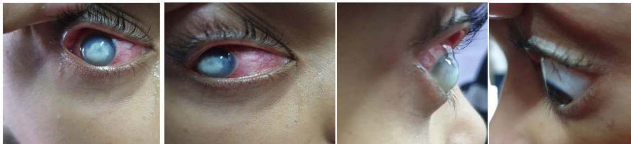
Figure 2: Infiltration Left Eye.