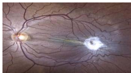
Figure 1: Fundus examination of the left eye showed a gray-flat fibrous lesion at the macula obscuring the fovea and the perifoveal region.

Epiretinal membrane is avascular fibrous tissue, which is adhered to the internal layers of retina in the macular area. Patient may be asymptomatic or present with blurring of vision and metamorphopsia.