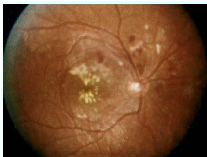
Figure 1: Vaso-occlusive lesions.

Antiphospholipid syndrome is an acquired thrombophilia characterized by the production of autoantibodies against a variety of phospholipids and phospholipid-binding proteins. These antibodies include anticardiolipin antibodies, b-2-glycoprotein-1 antibodies and lupus anticoagulan. When APS is diagnosed in the absence of any systemic disease that would account for elevation of these antibodies, the term primary antiphospholipid syndrome is used [1].