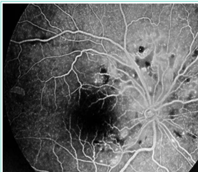
Figure 3: Severe retinal ischemia with perivasculature dilation: severe retinal ischemia with perivasculature dilation.

Retinal arterial or venous occlusion in primary or secondary APS is rare. Its frequency varies from 1% to 29% [2] depending on the study. Various ocular presentations have been reported in APS: central retinal vein or artery occlusion, diffuse retinal vaso-occlusive vasculopathy, sometimes severe [3].