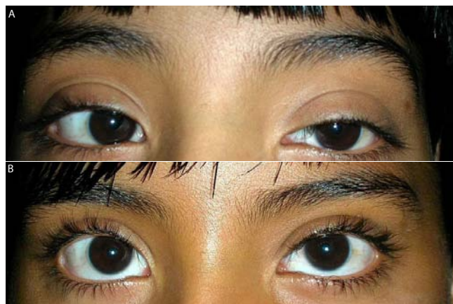
Figure 4a and 4b: Showing Preoperative and Postoperative Results of Fasanella Servat Surgery.