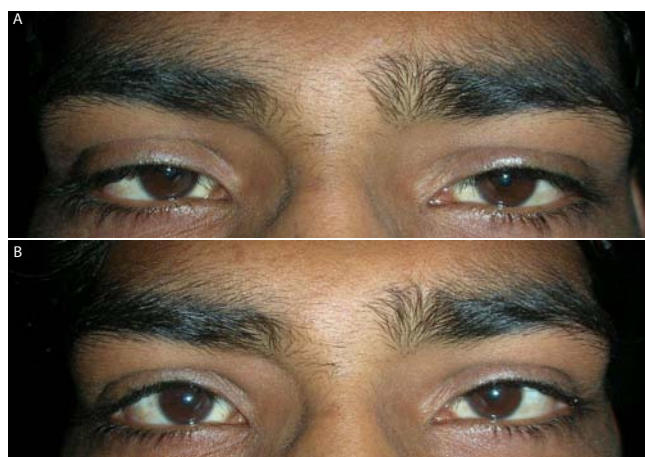
Figure 5a and 5b: Showing Preoperative and Postoperative Results of Mullerectomy.

levator aponeurosis resection and brow frontalis suspension. The determining factors as to which procedure is performed are the severity of ptosis and the amount of levator function. Levator function is the most important eyelid measurement in terms of surgical planning as the effectiveness of certain surgical procedures rests solely on the integrity of levator muscle function.