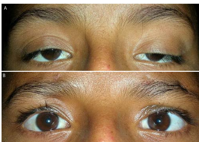
Figure 3a and 3b: Showing Preoperative and Postoperative Results of TarsoFrontalis Sling Surgery.