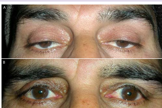
Figure 6a and 6b: Showing Preoperative and Postoperative Results of Levator Advancement Surgery.

Frontalis suspension surgery is done in congenital ptosis with levator function <4\text{mm} . In our series of 23 patients (28 eyes) silicone sling was used for frontalis suspension. The success rate was 82.6%. Failure was seen due to rod extrusion and granuloma formation. Carter et al retrospectively studied 35 patients (61 eyelids) who underwent frontalis suspension using silicone sling [8]. Final lid height was good in all 100% eyelids. Revision was required in 7% cases, migration of sling occurred in 5% cases and extrusion of sling in 5% cases. Morris et al retrospectively studied 89 patients (110 eyelids) had silicone rod frontalis suspension surgery [9]. Satisfactory result was seen in 63% cases. Complications occurred in 11% cases.