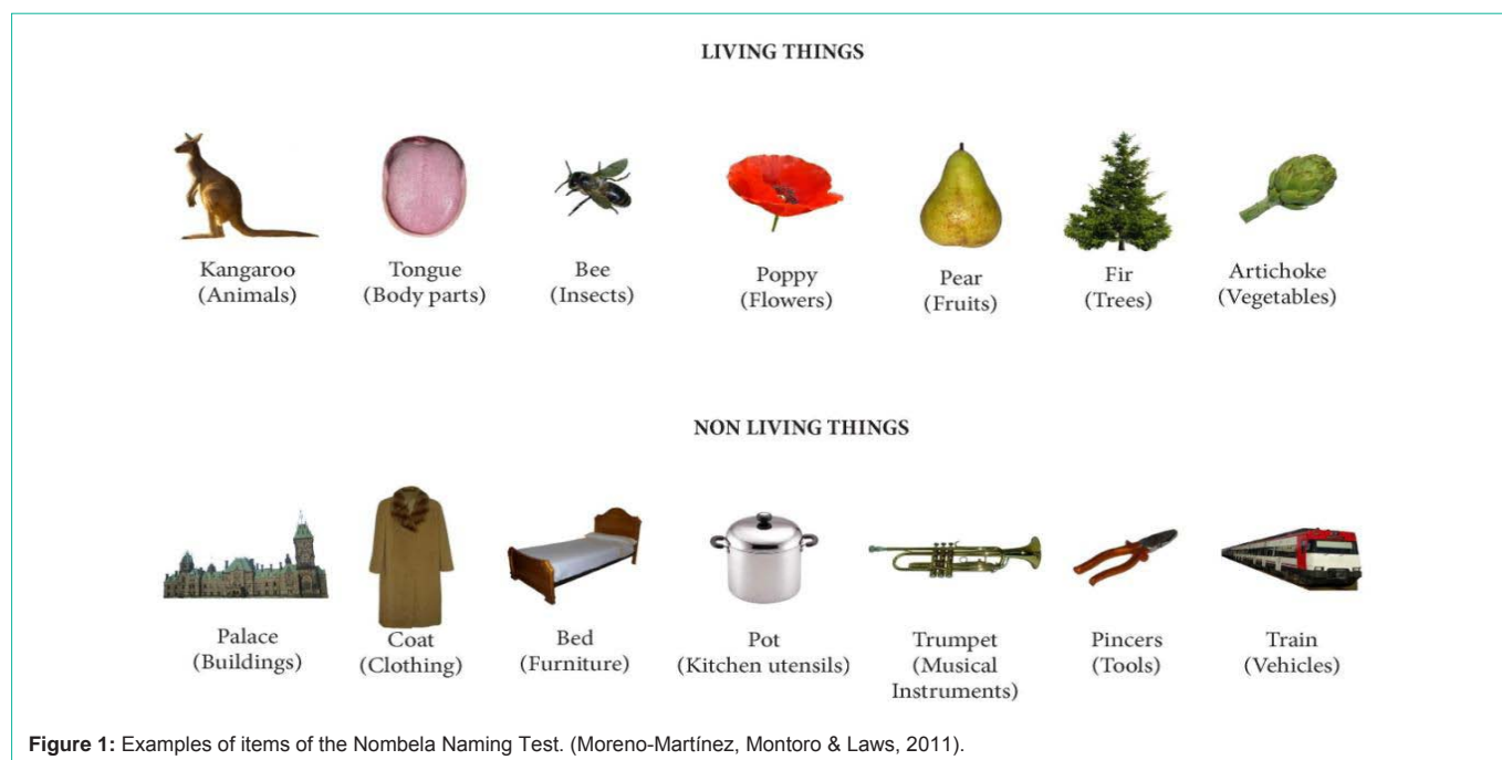
Figure 1: Examples of items of the Nombela Naming Test. (Moreno-Martínez, Montoro & Laws, 2011).

order to clarify their role into living-nonliving thing dissociations; on the other hand, categories such as trees, flowers or insects [27,45]; and NLT which varying in their degree of manipulability [52,53] must be also taken into account. It is also particularly important that items from LT and NLT are closely matched across domain in all the NV knowing to affect semantic processing. Furthermore, the selected items should make difficult healthy people get ceiling effects.