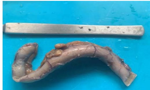
Figure 3: CMV appendicitis specimen.

Pathology occurring in HIV/AIDS patients may be classified into (a) diseases with a definitive association with HIV and (b) coincidental diseases seen in the general population especially as HIV/AIDS patients on HAART are living longer. The commonest presentation in AIDS requiring laparotomy is toxic megacolon, small bowel obstruction and localized peritonitis [1,9]. The commonest disease processes, CMV colitis, B-cell lymphoma, acute appendicitis with CMV infection and atypical Mycobacterium Avium Intracellulare (MAI) infection are quite different from that seen in the non- HIV population [1,9,10]. The case demonstrates a good clinical outcome following early intervention on an HIV/AIDS patient with most probable toxic CMV colitis and appendicitis.