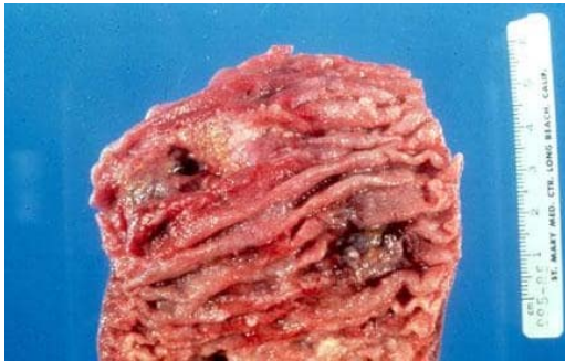
Figure 1: Macroscopic view of CMV Colitis showing mucosal ulceration (with permission-Cho et al. [11]).