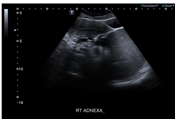
Figure 2: Pelvic free fluid.

The patient was treated as a likely ruptured ectopic pregnancy. A haemorrhagic corpus luteum was also considered. With consent, an emergency laparoscopy was arranged using a direct umbilical port entry. Paradoxically, there was no evidence of haemorrhage. The pelvis was dry, and the uterus and tubes were normal however, a large, right-sided ovarian cyst was identified, filling the Pouch of Douglas and extending across the midline up along the posterior abdominal wall (Figure 3). The cyst was smooth-walled, intact and showed no evidence of torsion. No further action was taken. A Dilation and Curettage (D&C) were performed, having noted the falling hCG titres. Currettings were sent for histopathology.