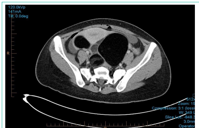
Figure 4: CT Pelvis.

Histopathology of endometrial curetting reported secretory change with Arias Stella's reaction. Serial b-HCG continued to downtrend, becoming negative 4 weeks later. Tumour markers showed Ca 125 at 87 U/ml (<35), Ca 19.9 at 131 U/ml (<35), AFP of 2.5, and a CEA of 2.6 (<0.5).