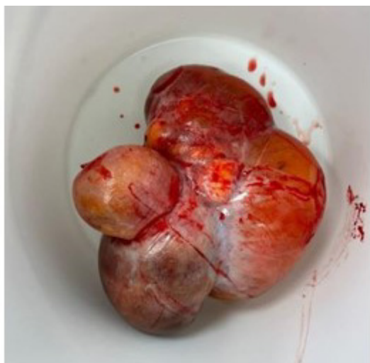
Figure 5: Surgical specimen – Dermoid cyst.

posteriorly to the midline, filling the POD and up towards the pelvic brim along the posterior abdominal wall. There was no distinguishable normal ovarian tissue. The right fallopian tube was intimately adherent and could not be separated. The Dermoid was removed without rupture (Figure 5). The uterus was normal. Two small 3x2 cm uncomplicated cysts were also identified in the left ovary. These were aspirated for cytology but otherwise left intact. Histology confirmed a mature cystic teratoma surrounded by a fallopian tube. Cytology from both cysts in the remaining left ovary was normal. The patient recovered fully. Repeat tumour markers 2 weeks later were normal.