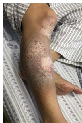
Figure 1A: Dark red maculopapular rash on the extended side of right lower leg, covered with thick layer of white scales, with the lesion extending to the knee and lower 1/3 of the lower leg.

Laboratory and auxiliary examinations: routine blood, urine and feces, coagulation function, blood biochemistry and serum protein electrophoresis showed no obvious abnormalities. Chest CT plain scan considered bronchiectasis of both lungs, and the combined infection was better than the previous absorption. Histopathological examination of skin lesions: incomplete keratinization of epidermis, neutrophil infiltration in local areas, thinning of granular layer,