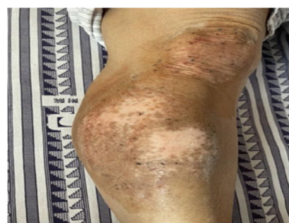
Figure 1B: After 2 weeks of treatment, the skin lesions subsided significantly.

pestle like elongation of epithelial feet, and a large number of chronic inflammatory cells in the superficial dermis (Figure 2).