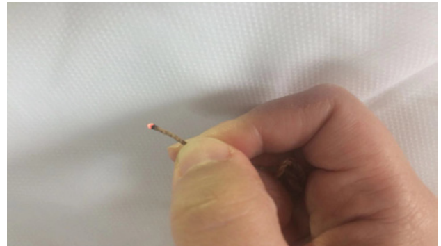
Figure 3: Zhuang medicine thread moxibustion.

pricking therapy, once a day, five times a week (qw1-qw5), for 2 weeks. After treatment, the skin lesions at the affected area were significantly improved, the scales were basically completely shed, and the normal skin was exposed at the rash site, leaving only pigmentation and white spots (Figure 1B). After 2 months of follow-up, there was no recurrence, and the skin pigmentation gradually subsided after 1 month of continuous intermittent treatment (1-2 times a week). This patient is still in follow-up.