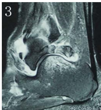
Figure 3: MRI showing high signal in the os trigonum and the normal signal in the talus.