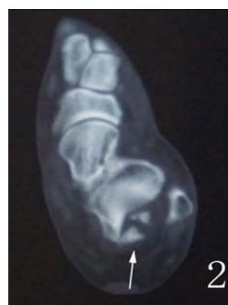
Figure 2: CT axial scans showing the neat and sharp fracture surface.

intensity was seen in the os trigonum, accompanied by the fracture. But there was no abnormal signal in the talus (Figure 3).