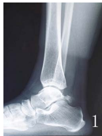
Figure 1: Lateral radiograph showing free bone behind the talus.

Lateral radiograph of the ankle showed free bone with sharp edge behind the talus (Figure 1). But this bone mass was unable not to be distinguished from the fracture of the posterior process of the talus. CT and MRI were required to identify them. Sagittal scans of CT showed the fracture of the os trigonum. The os trigonum was divided into two parts. The fracture surfaces were neat and sharp (Figure 2). MRI showed soft tissue edema behind the ankle, and high signal