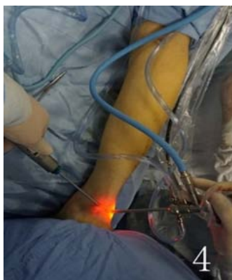
Figure 4: Posterior ankle arthroscopy.