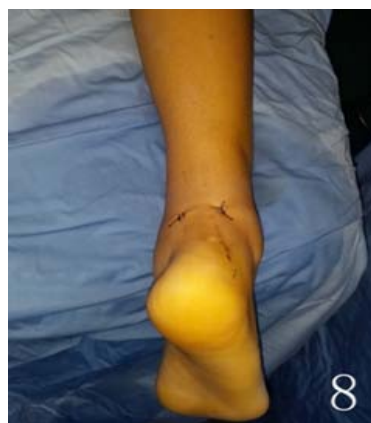
Figure 8: The incisions of surgery.