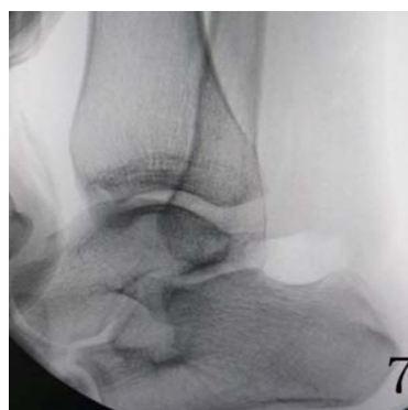
Figure 7: Fluoroscopy after surgery.