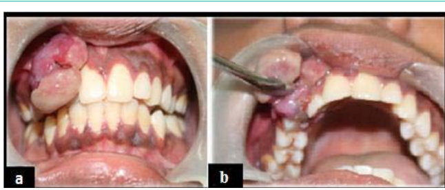
Figure 2: Shows two lobulated soft tissue masses in relation to maxillary right lateral incisor and canine. (a and b).