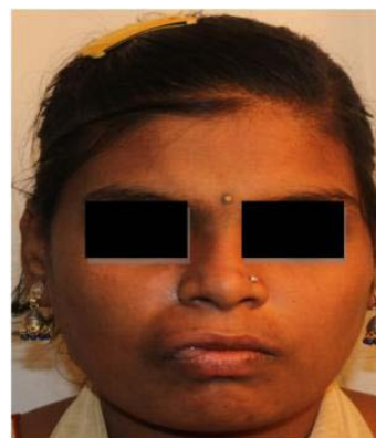
Figure 1: Patient profile with right facial asymmetry.

A 16 year old female patient came to the Department of Oral Medicine and Radiology with complains of pain in relation to the upper right back teeth region since three months. Patient was apparently normal one-year back then she noticed growth, it was small in size and progressive to present size. She had history of pain while chewing and during brushing and also bleeding on touch. Patient had undergone treatment for the same since one-year back and they excised the lesion completely. On extraoral examination reveals Gross asymmetry noted. Swelling seen over of size approximately 2’1.5 cm extending superiorly from right ala of the nose to the upper lip and mediolaterally from the midline to the corner of the lip. Extension of