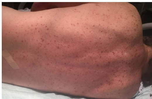
Figure 2: Case 1 had a maculopapular rash classically seen in Ehrlichiosis.

His 14-3-3 antigen was positive and his RT-QUIC was negative in Cerebrospinal Fluid (CSF). An infectious serology sent to the Mayo Clinic revealed he was positive for E. chaffeensis . He was continued on Doxycycline 100mg every 12 hours for a 14-day course. His mental status and lab abnormalities gradually improved over an 11-day span after Doxycycline was started. He was discharged to a skilled nursing facility from the hospital. On telephone follow up five months later, his wife stated that he was nearly back to his baseline (Figure 2).