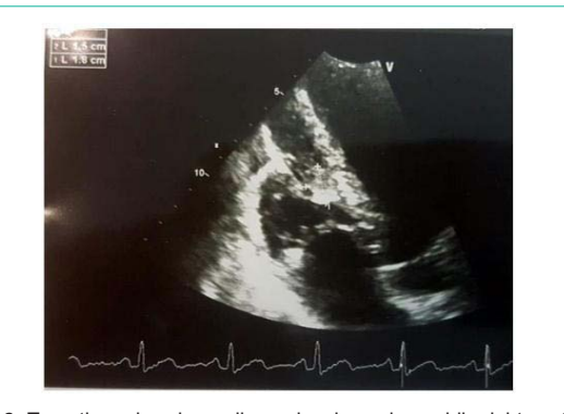
Figure 2: Transthoracic echocardiography showed a mobile right ventricular mas.

Hemoptysis keeps to be the main cause of death due the pulmonary aneurysm rupture in patient with Hughes Stovin syndrome.