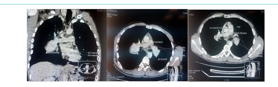
Figure 1: Contrast-enhanced CT scans of his chest demonstrated a bilateral pulmonary artery aneurysm.